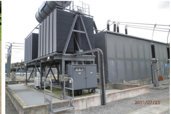
400 kV Power Transformer