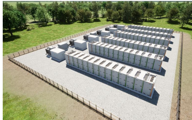
Battery Storage Compound