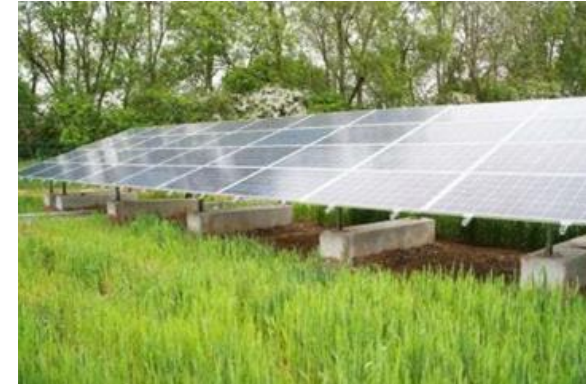
Panels with Concrete Feet